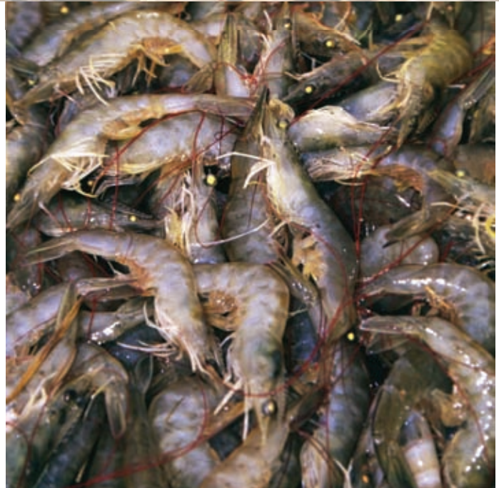
The traits of fast growth and disease resistance have established domesticated white shrimp as the world's top cultured shrimp species.

The domestication of Pacific white shrimp changed the face of aquaculture in the early 1990s. The development of specific pathogen-free Penaeus vannamei stocks and subsequent breeding in the United States led to rapid adoption of the domesticated shrimp throughout the Western Hemisphere and Asia. Increasing global production has triggered lower shrimp pricing.