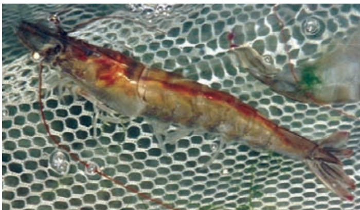
Specially bred broodstock have largely replaced wild animals as sources for quality postlarvae.

tiated a breeding program to develop fast-growing, TSV-resistant P. vannamei in 1997. To date, 10 generations of selection have been completed.